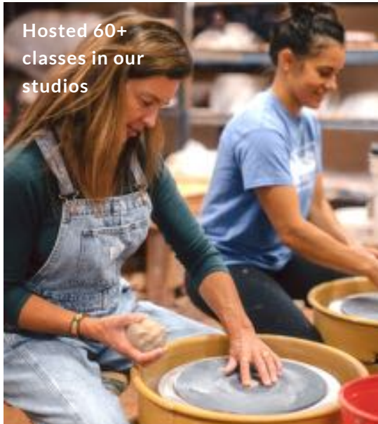
Hosted 60+ classes in our studios