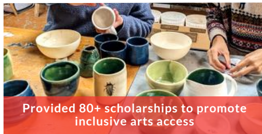
Provided 80+ scholarships to promote inclusive arts access