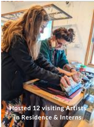
Hosted 12 visiting Artists in Residence & Interns