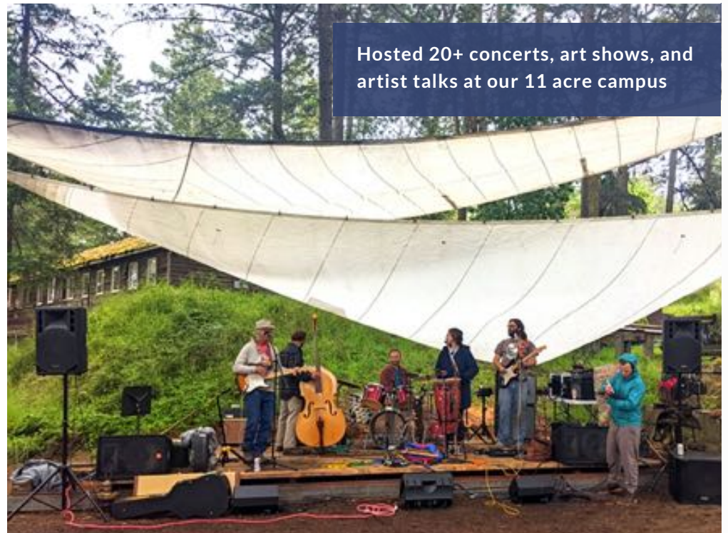
Hosted 20+ concerts, art shows, and artist talks at our 11 acre campus