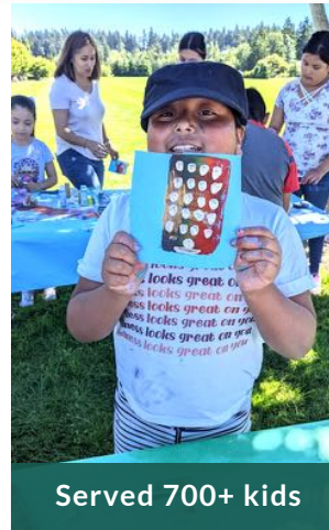
Served 700+ kids