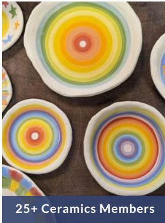
25+ Ceramics Members