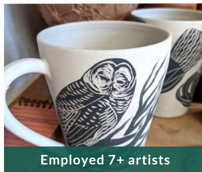
Employed 7+ artists